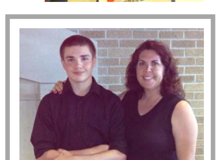
We are proud to sponsor and serve as match witnesses for the the Newport Junior Rifle Team whose members practice and compete at the Newport Rifle Club. The professional manner in which these young adults conduct themselves is outstanding! To learn more, visit www.legion.org/shooting/.