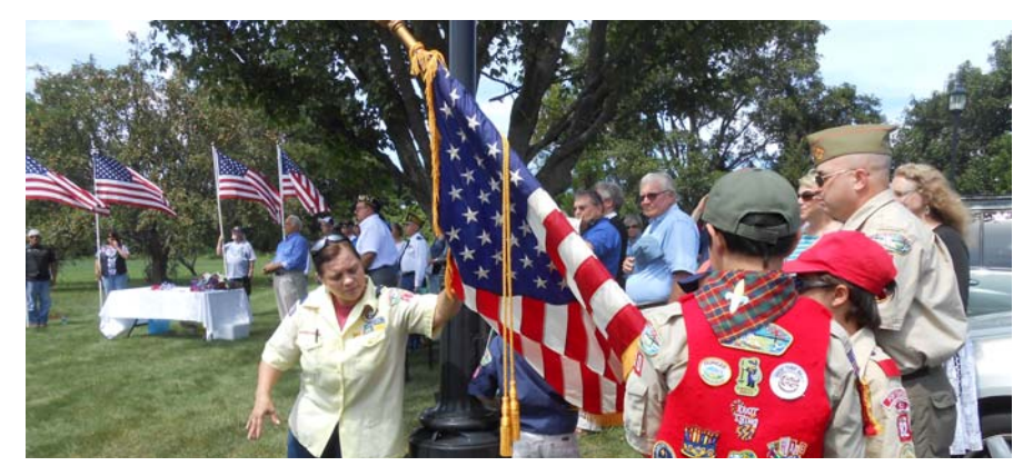
NAVAL SEA CADETS and CUB AND BOY SCOUTS regularly provide Color Guards for our events for which they receive a small donation. (YEAR ROUND)