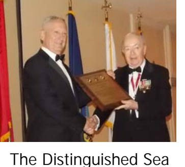
Service Award was bestowed upon General James Mattis, USMC (Ret.), former commander of U.S. Central Command (USCENTCOM). Many members of Post & Unit 18 were in attendance! (1 NOV 2014)