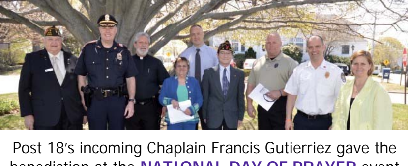
benediction at the NATIONAL DAY OF PRAYER event @ Portsmouth Town Hall on 7 MAY 2015

One Post 18 member, one Unit 18 member and one Dual member attended the READING OF GEORGE WASHINGTON'S LETTER TO THE HEBREW CONGREGATIONS @ Touro Synagogue