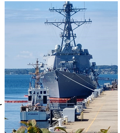
The future USS DANIEL INOUE visited Newport on 8 OCT 2021 on way to commissioning in homeport in Pearl Harbor

All patriotic citizens are invited to attend our annual Veterans Day ceremony (details below) at Portsmouth Town Hall. We have a great guest speaker and the community participates in this program. This year our theme is Women's Contributions to the Military. Attend and help us celebrate our veterans.