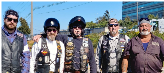
FLYING INFORMATION—FALL 2021—PG 5

Members of the RI Patriot Guard Riders went to view the visiting ship at Naval Station Newport on 8 OCT 2021. Volunteering affords opportunities to give back to our community, meet new friends and experience the camaraderie we enjoyed as military families.